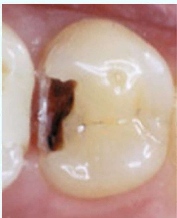
Tooth with dental decay