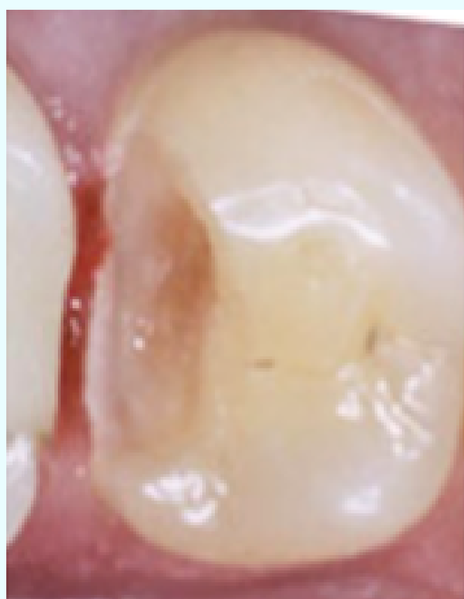
Tooth prepared for filling with decay removed