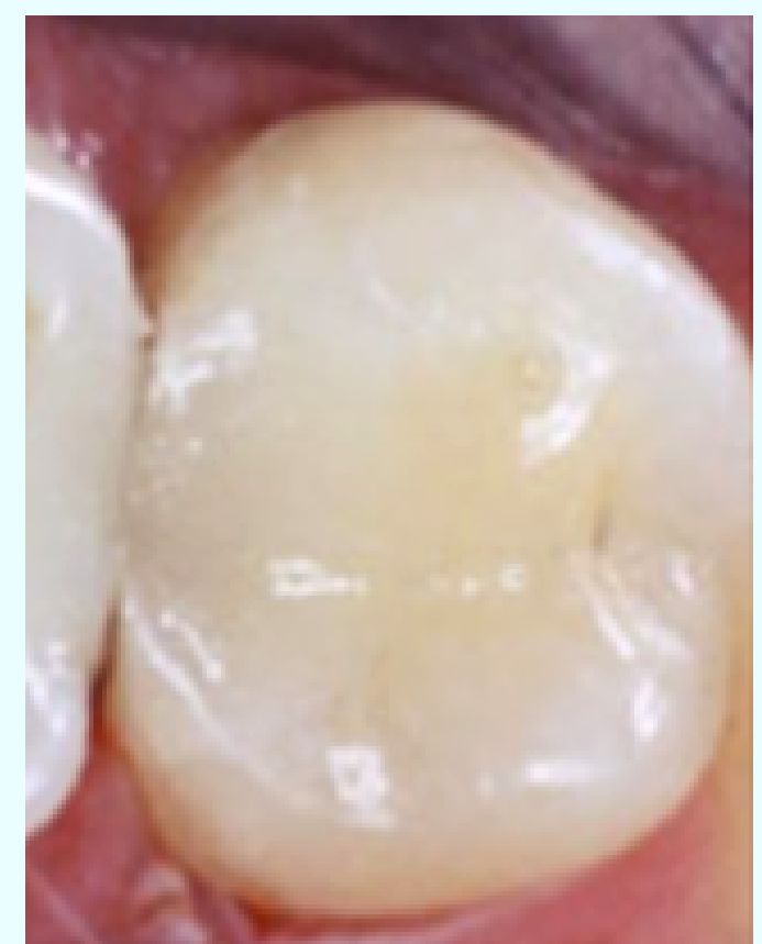
Filling placed and finished