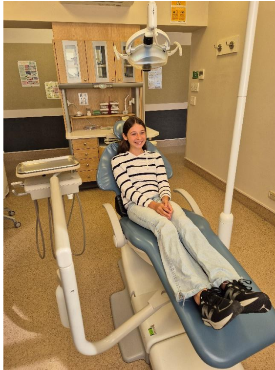
I can sit on the dental chair. It lies down flat like a surfboard.