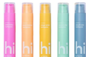
HI SMILE RANGE