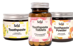
SOLID TOOTHPASTE, POWDER & TABLETS